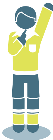
Indirect free kick