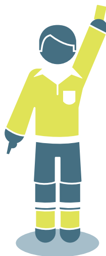
Red and Yellow card