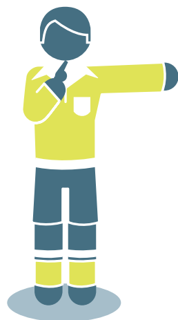
Direct free kick